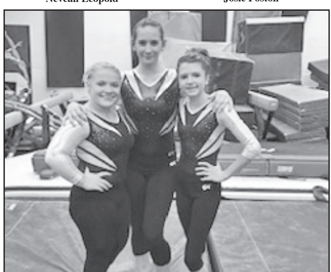
Mountain Gymnastics Center USA Level 6

5. Patton's performance was highlighted by a high score on the floor exercises.