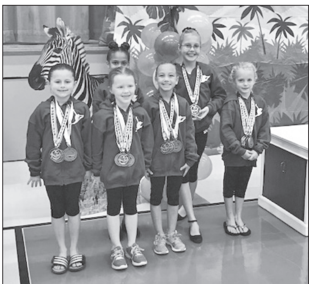
Mountain Gymnastics Center AAU Level 2

In AAU Level 2, Davis recorded a 36.275 all around